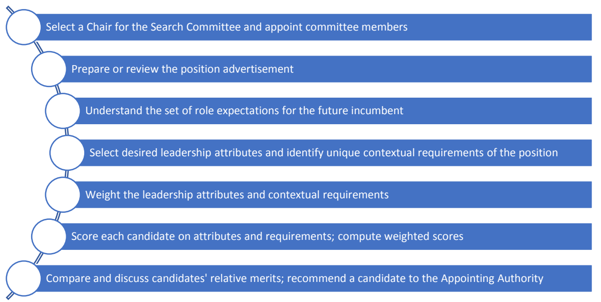
Figure 1: Sequential Flow of the Search Process

Ultimately, subjective judgment in selecting a candidate is inescapable, but there are ways to lower the degree of subjectivity. In this article, we suggest an approach to structure search committee processes noted in Figure 1 below.