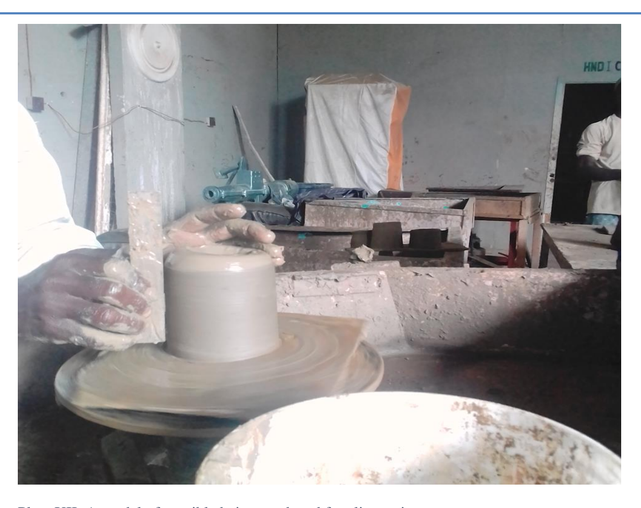
Plate XII: A model of crucible being produced for slip casting