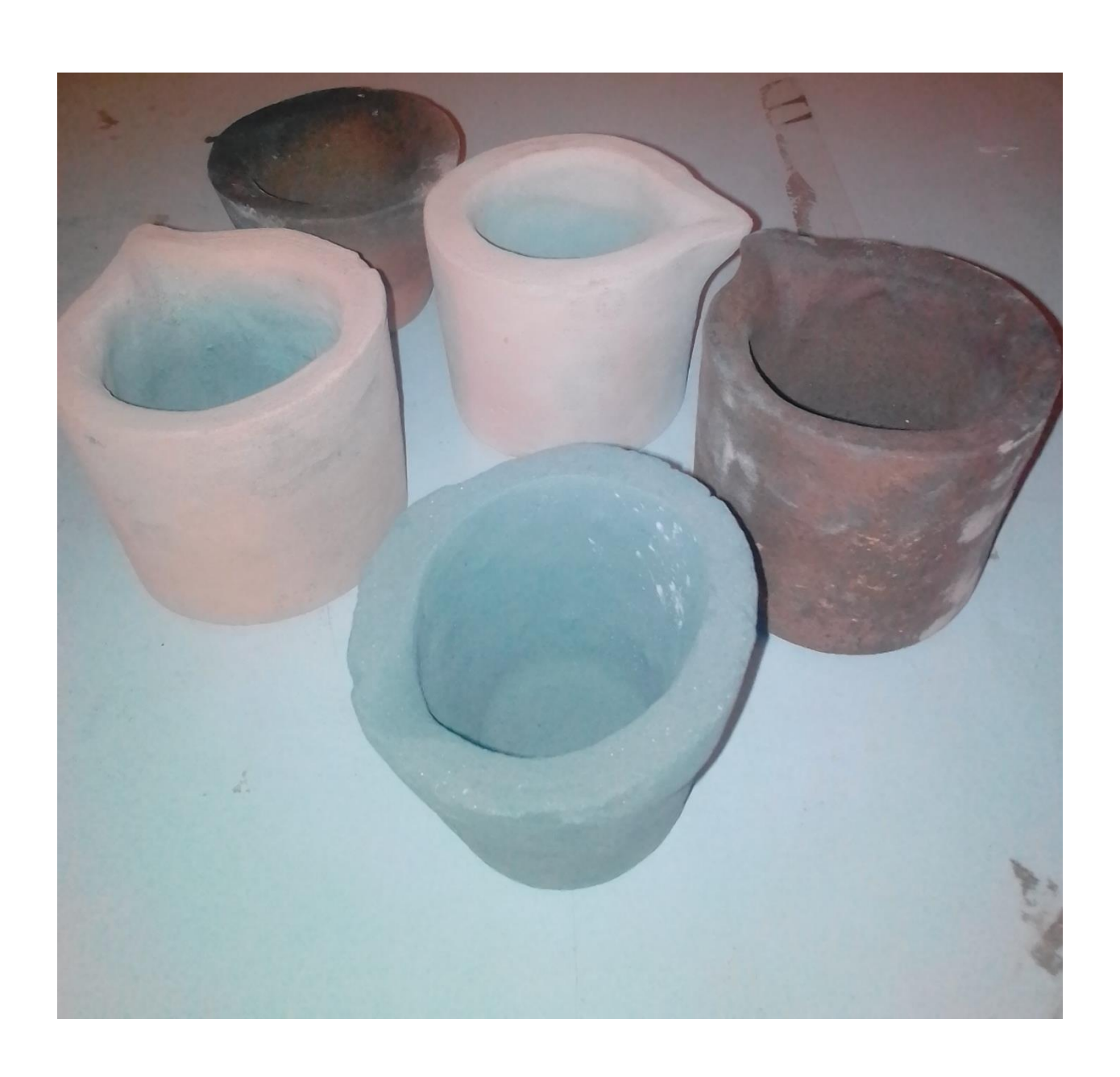
Plate XV: Graphite crucibles produced

Plate XIV: Slip is poured in the plaster mold