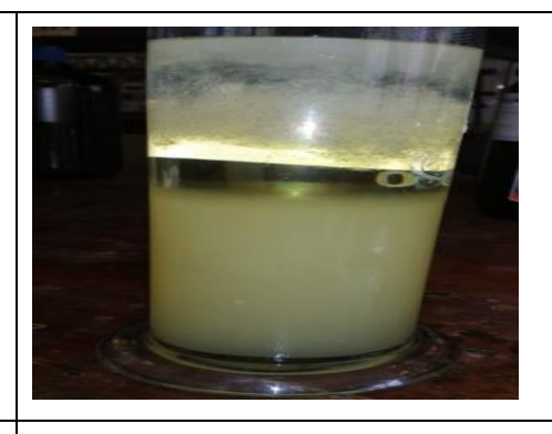
Figure 2: Floating of the pectin after mixture settling for 30 minutes