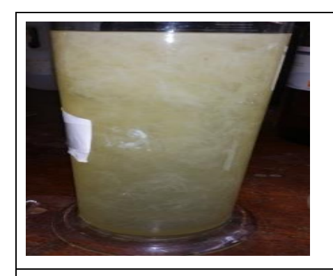
Figure 1: Precipitation of pectin after addition of alcohol